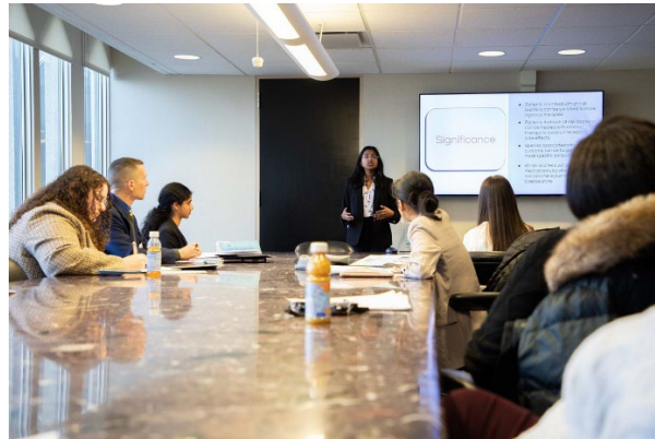
Oral Presentation Session at MI Regional JSHS 2023