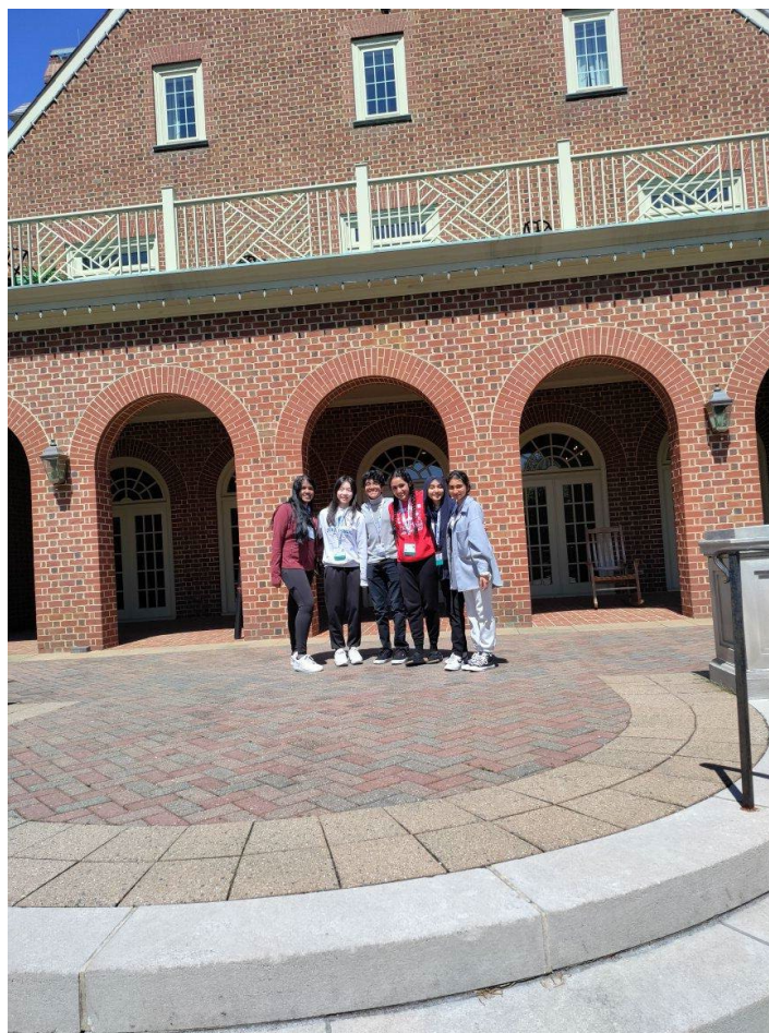
Michigan Regional Delegates at National JSHS 2023, Virginia Beach, VA