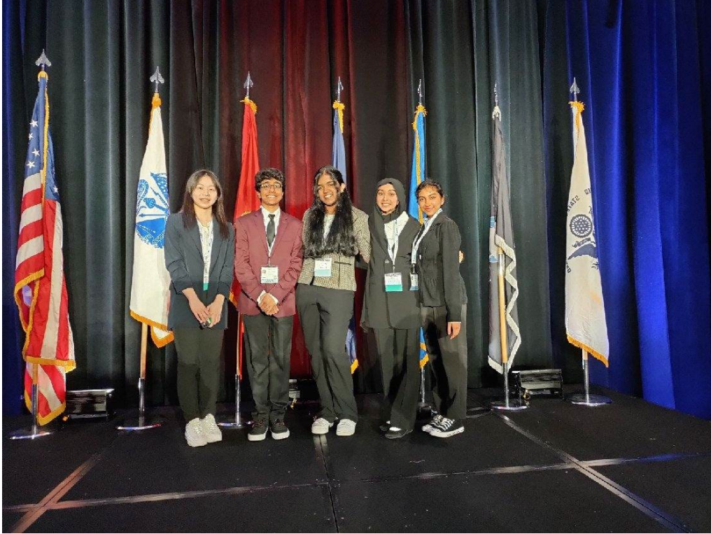
Michigan Regional Delegates at Awards Ceremony, National JSHS 2023