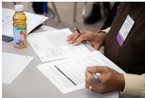
Judging MI Regional Presentation at JSHS 2023