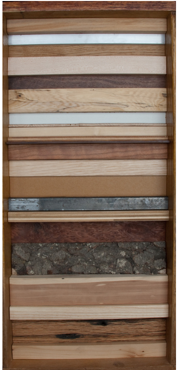
History of Craftsmanship